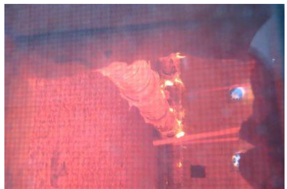
Figure 5: Furnace Interior during burn test