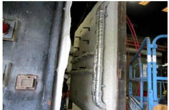
Figure 3: Moving assembly wall onto test furnace