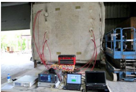
Figure 4: Signaling equipment connected