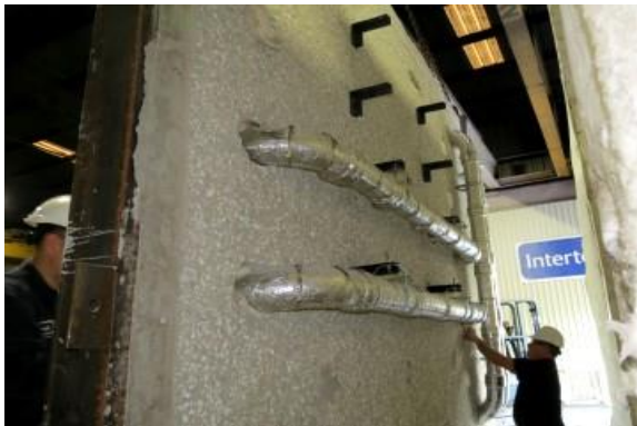
Figure 2: Mounting assembly on exposed side